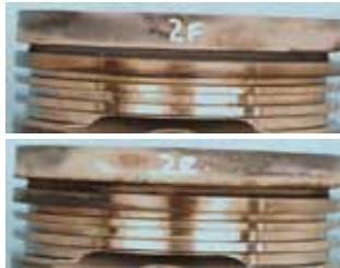
Minimal piston deposits after a proprietary 500-hour endurance test of Cat DEO-ULS.

Cat® DEO-ULS™ delivers excellent valve train protection.